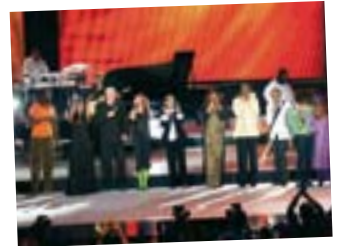
2005: Switzerland and the UN organize the 'United Against Malaria' concert in Geneva, with performers including Peter Gabriel and Youssou N'Dour.

the National Council and the Council of States. When the Federal Council's annual report is submitted to them, the National Council and the Council of States also have the opportunity to take a position on our country's priorities for the next session of the UN General Assembly. Furthermore, members of the two Federal Chambers make ready use of the instruments at their disposal (interpellations, questions, motions and petitions) in their quest for a more profound dialogue with the Federal Council regarding our country's relations with the United Nations. Parliamentary interventions have focused on Switzerland's participation in peacekeeping operations, as well as the amount of our country's contributions to the United Nations.