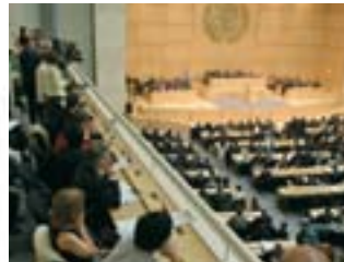
2006: First session of the UN Human Rights Council at its Geneva HQ.