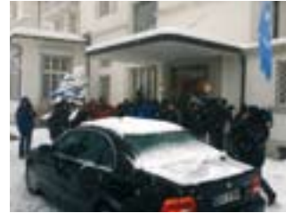
2004: UN talks on Cyprus held in the Swiss resort, Bürgenstock.