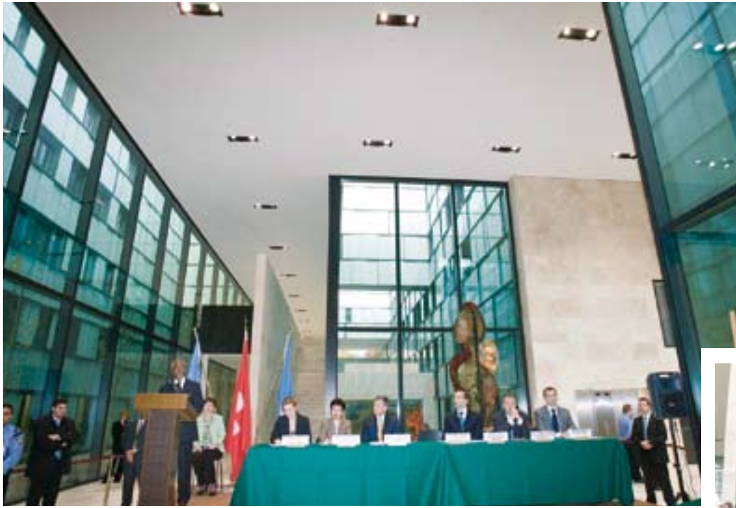
The UN Secretary-General, Kofi Annan, inaugurates the new headquarters of the World Health Organization (WHO) and the UNAIDS Programme in Geneva, in November 2006.