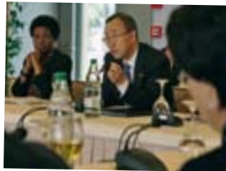
2007: The UN Secretary-General, Ban Ki-moon, chairs the UN Chief Executives Board (CEB) meeting in Geneva.