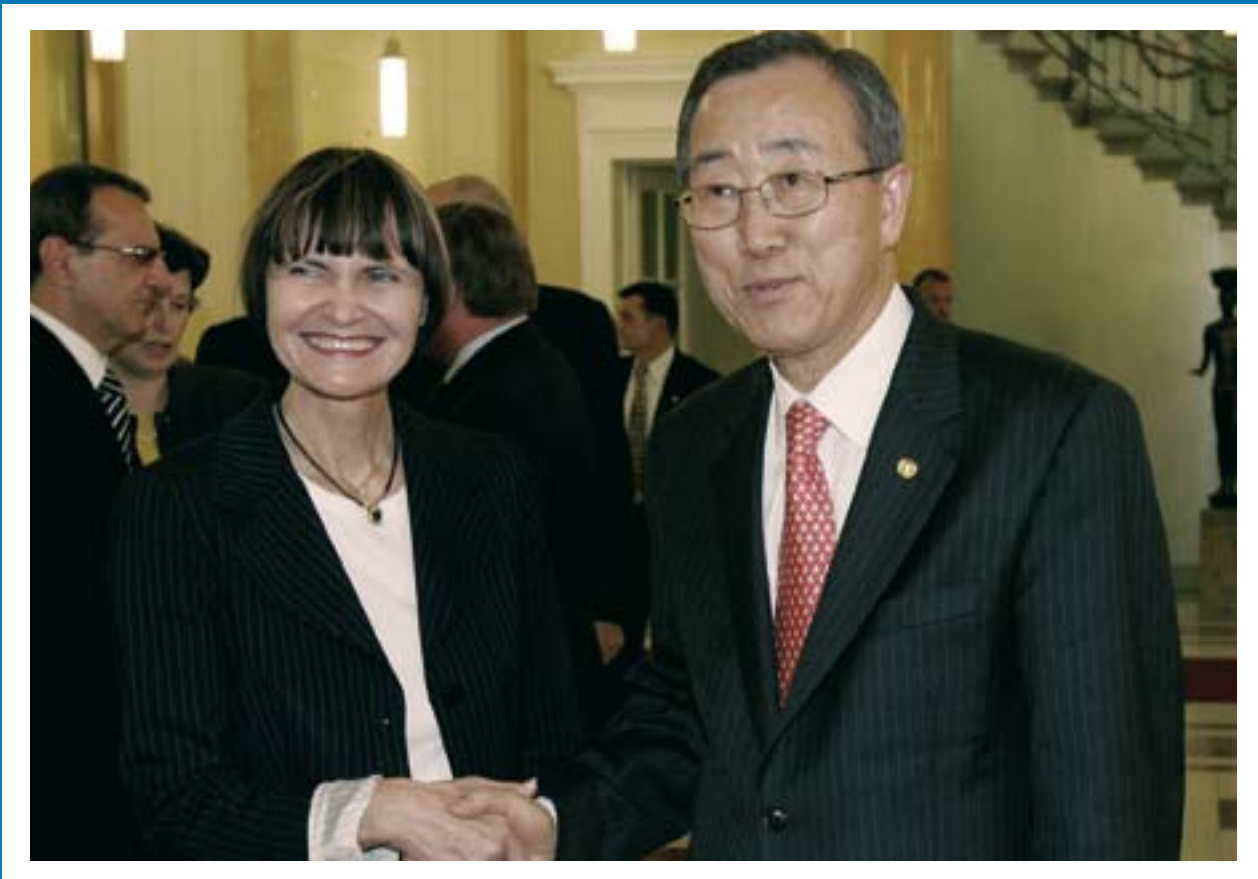
The President of the Swiss Confederation, Micheline Calmy-Rey, meets the new UN Secretary-General, Ban Ki-moon, in Bern.

Boutros Boutros-Ghali. On 1 January 1997 he was the first UN employee and the first representative of Sub-Saharan Africa to be appointed Secretary-General of the United Nations. During his period of office, Kofi Annan shaped the UN more than most of his predecessors and indeed embodied the UN. The joint award of the 2001 Nobel Peace Prize to Kofi Annan and to the United Nations marked the climax of his very successful first period of office.