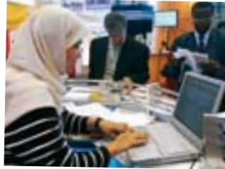
2003: Office at Geneva (UNOG) hosts the World Summit on the Information Society.