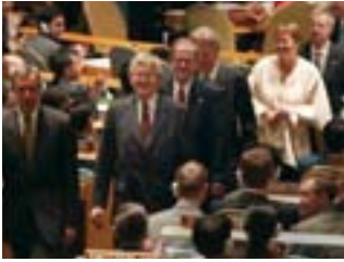
2002: Switzerland officially accedes to UN membership.

Switzerland in the United Nations: First five years